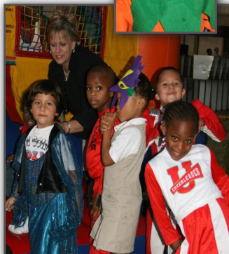
THE 2008 FESTIVAL BOUNCE HOUSE WAS VERY POPULAR.

Come experience the joy of serving others firsthand.