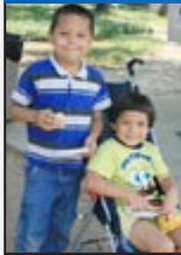
Bruton Oaks children and adults alike had fun at Sidewalk Sunday School, playing games, winning prizes and eating hot dogs!